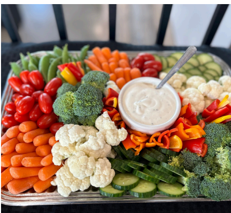
Vegetable Tray with Ranch