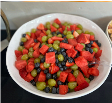
Mixed Fruit Bowl