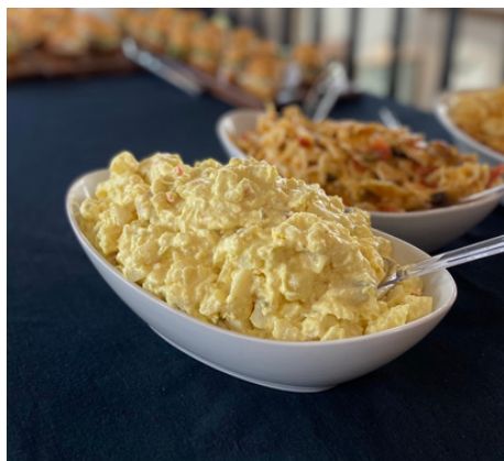
Potato Salad Bowl

Regular (Feeds up to 20 people) $40 Large (Feeds up to 40 people) $80