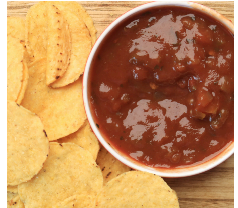
Chips and Salsa