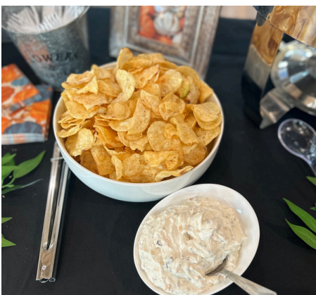
Kettle Chips and Bacon Cheddar Ranch Dip Bowls

Regular (Feeds up to 20 people) $35 Large (Feeds up to 40 people) $50