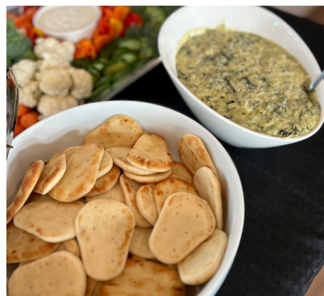
Spinach and Naan Bowls