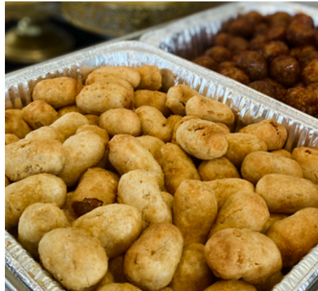
Honey Battered Corn Dogs