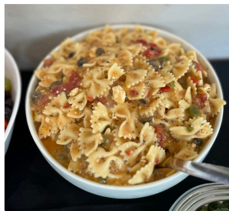
Greek Pasta Salad Bowl

Regular (Feeds up to 20 people) $40 Large (Feeds up to 40 people) $80