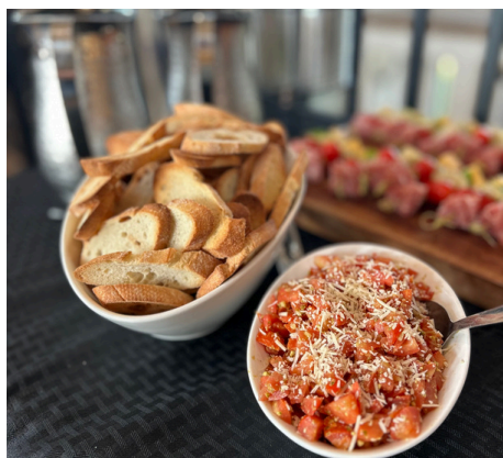
Bruschetta and Baguette Bowls