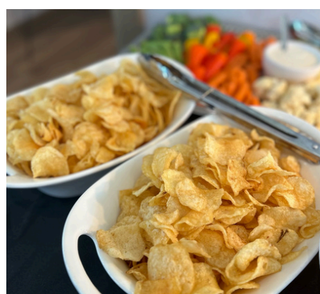
Kettle Chips Only.

Regular (Feeds up to 20 people) $35 Large (Feeds up to 40 people) $50